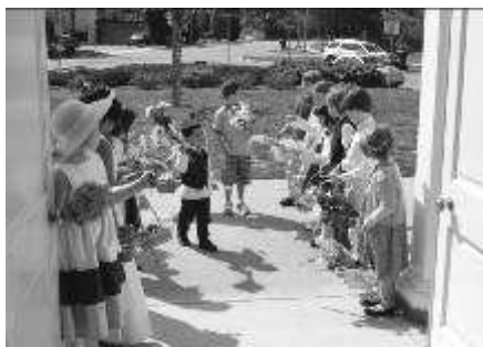
Some of our children giving out flowers following the Easter Service.

Some of our folks like the convenience of handling giving and pledges through Electronic Funds Transfer. For more information, see the church website. Authorization forms to start that process can be found in the Narthex, and near the Fellowship Hall and Church Office.