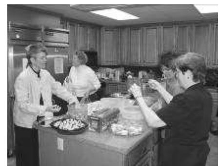
Our kitchen helpers prepare for the reception following the memorial service.