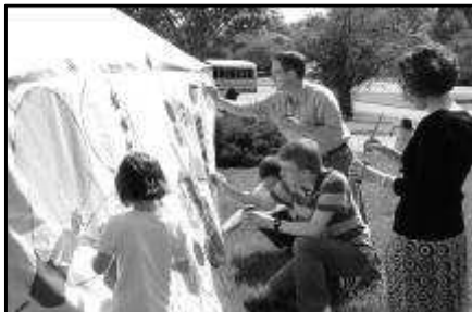
Painting our Tent of Hope.