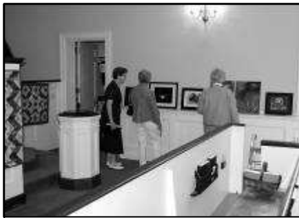
Viewing some of our works of art.