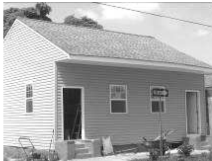
House number two.