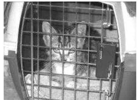
Pontch, our Rescue Kitten.