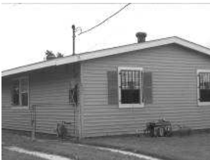
This is the first house we worked at.