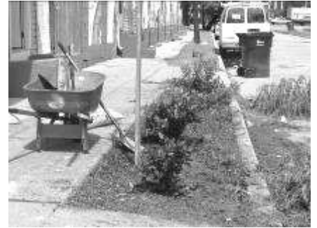
The yard at house number two.