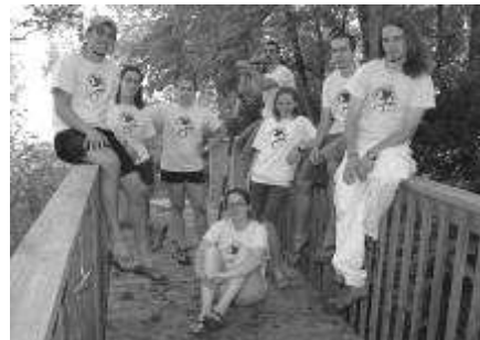
The friendly and energetic staff at Johns River Valley Camp.