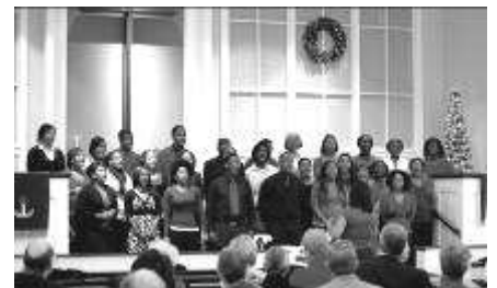
The Neo-Black Society Gospel Choir of UNCG worshipping with us on December 6th.